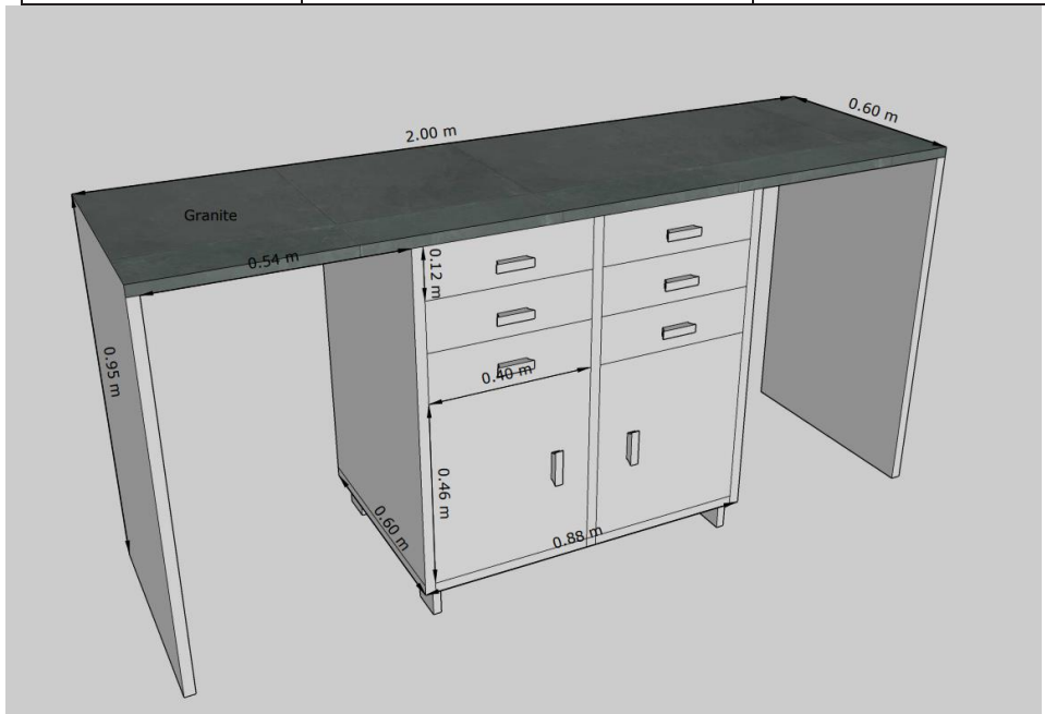
Figure 1: Dimensions for Lab Modular Table