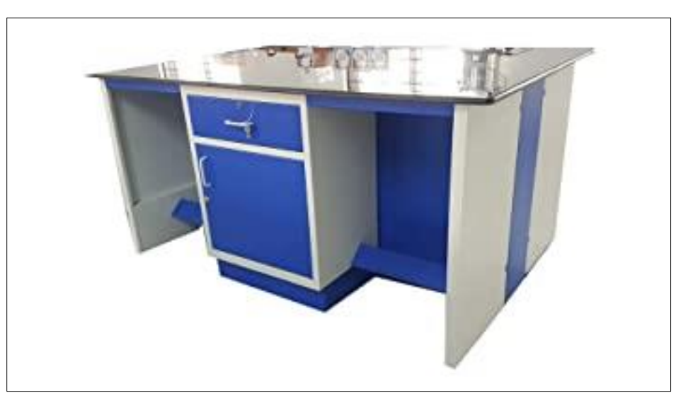
Figure 2: Pictorial of Lab Modular Table