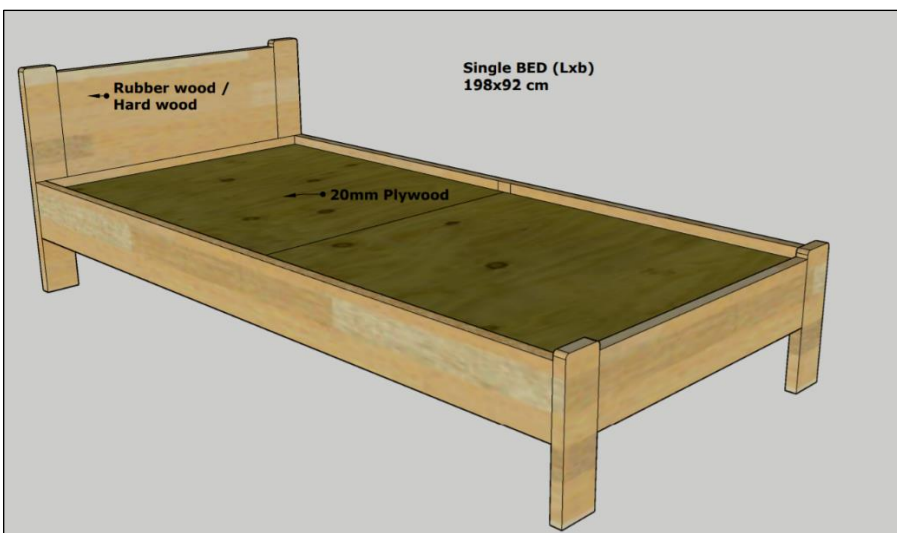
Figure 3; Bed Overall Design